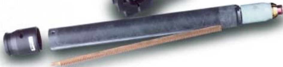
Detachable 32 Pitch Gear Rack