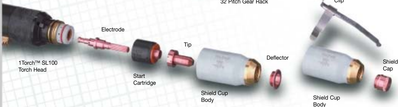
Shield Cup Body